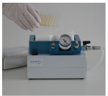
Pipette sample into the filter plate